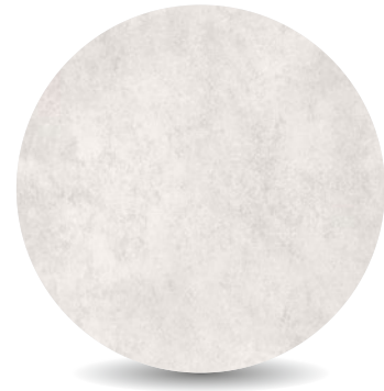
METAL PEARL SL

Named to recall its characteristic shade, our Techlam® Metallo Pearl porcelain could well pass for the lunar surface. Like a pearl in a moonlit night, its luminous surface reflects and projects the light over walls, floors or pieces of furniture, highlighting its pores and different nuances in a finishing which, albeit homogenous at first sight, discloses its "perfect imperfections" up close.